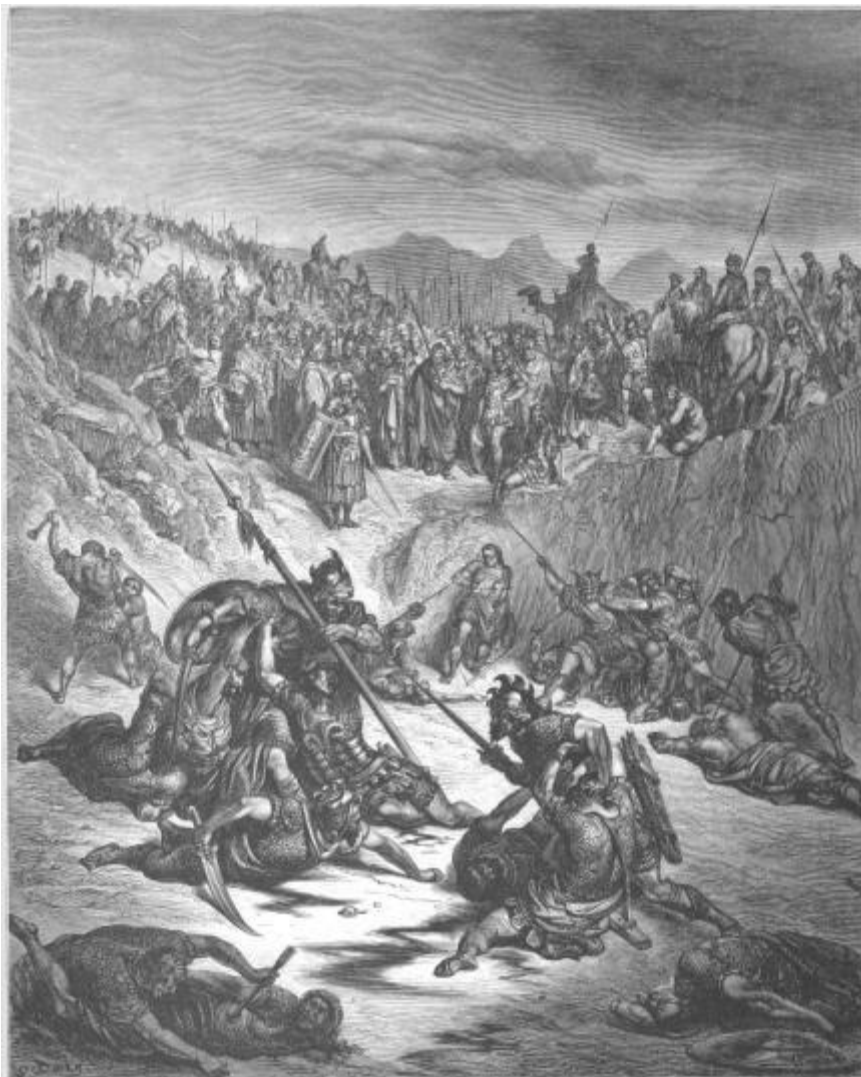
COMBAT BETWEEN THE CHAMPIONS OF ISH-BOSHETH AND DAVID Then there arose and went over . . . twelve . . . which pertained to Ish-bosheth the son of Saul, and twelve of the servants of David. And they caught every one his fellow by the head, and thrust his sword in his fellow's side; so they fell down together . . . And there was a very sore battle that day . . . (II Samuel 2: 15, 16, 17) (2:114)

[6] What happened to Obed-edom the Gittite when the ark was placed in his care? The Lord blessed him. 2Sam 6:11