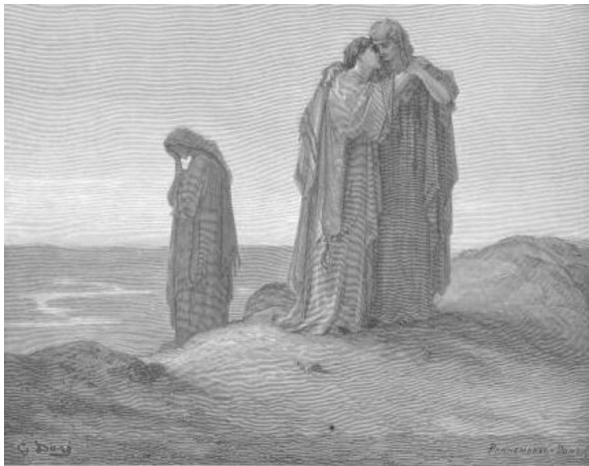
NAOMI AND HER DAUGHTERS-IN-LAW

And Ruth said, Intreat me not to leave thee, or to return from following after thee: for whithersoever thou goest, I will go; and where thou lodgest, I will lodge: thy people shall be my people, and thy God my God. . . (Ruth 1: 16) [1: 18]