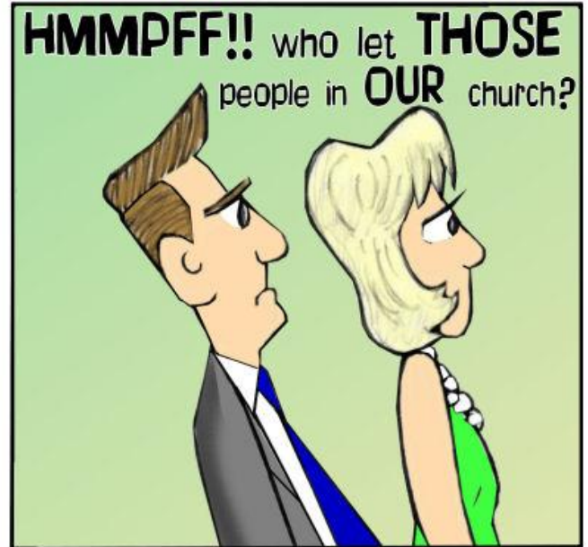
Judgment looms under every steeple, where lofty glances from lofty people -Casting Crowns -Can Ruin a Good Church- Mt 7:3-5, Jk 2:3,15-16