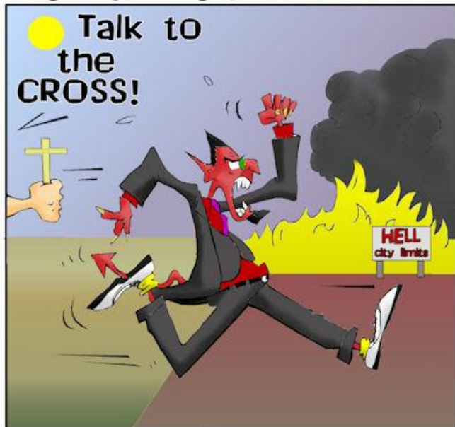
Give yourself completely to God. Stand against the devil, and he devil will run from you. Js 4:7