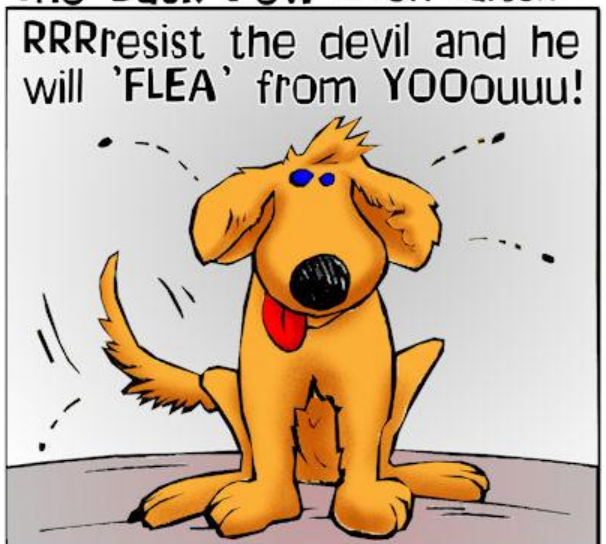
A scripture truth any dog can appreciate. James 4:7 delivered by Rev. Rover