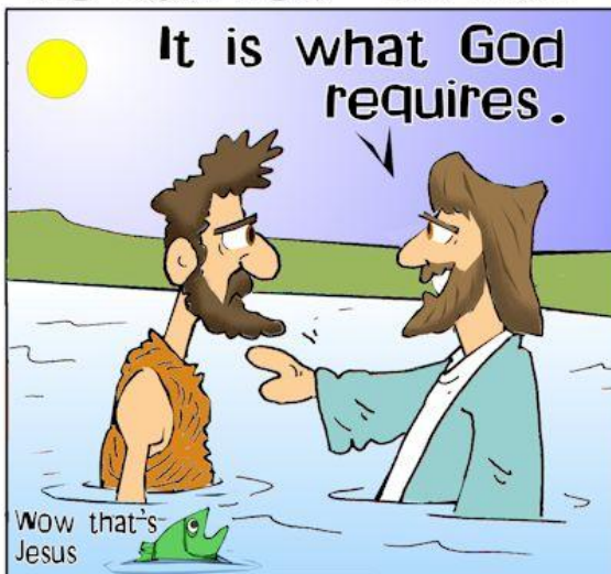
As Jesus was baptized Calvin Carp watched on. The next time Cal would see Jesus was when Jesus fed 5,000 with a few loaves of bread, Calvin and a couple of his buddies.

[B1] Why did Jesus say John should baptize Him? _____ _____