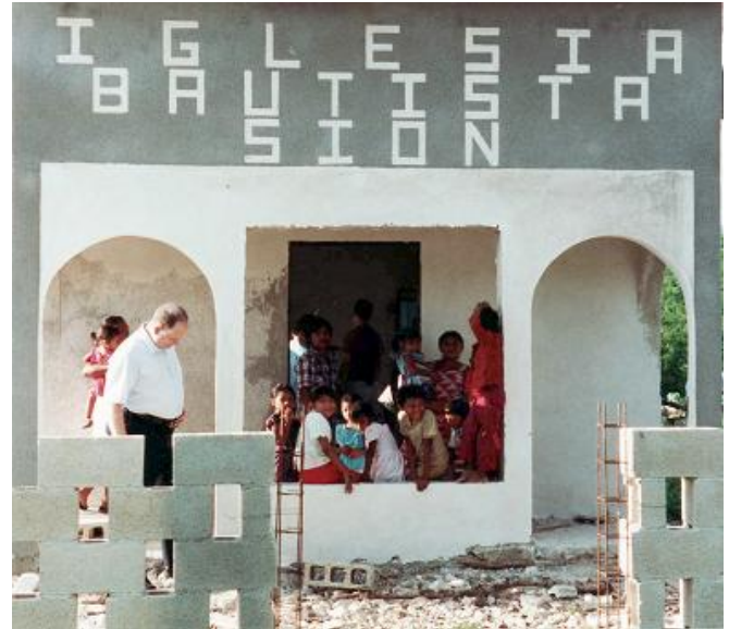
Celebrating the Sabbath in the Yucatán

Four disciples are called, Jesus attends a party with the culturally unacceptable, tells some puzzling parables and questions about the Sabbath arise.