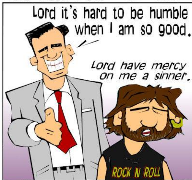
The TV Evangelist, and the Radio Shock Jock. Luke 18:9-14